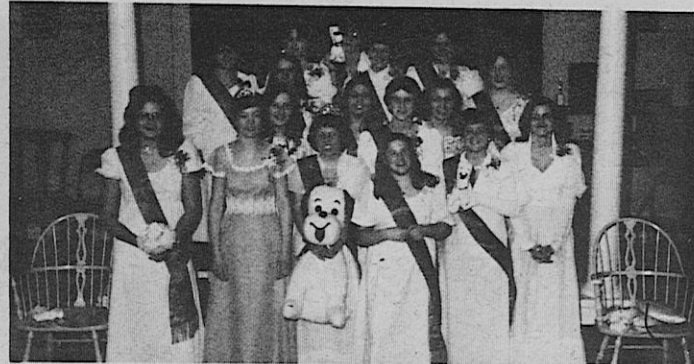
New Officers of Lilac Triangle No. 121

May 30 - Roller skate party at Olympic Bowl, 5 to 7 p.m.